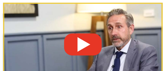
Brent outlines benefits of the course